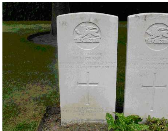
DUHALLOW A.D.S. CEMETERY