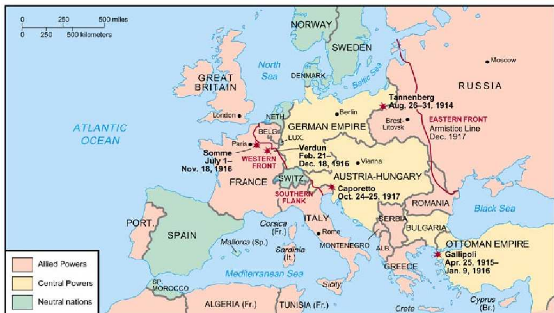
EUROPEAN ALLIANCES AND BATTLEFRONTS, 1914-1917

The BEF first saw action in Belgium at the defence of Mons which due to overwhelming odds resulted in a retreat as the Germans pressed on towards Paris.