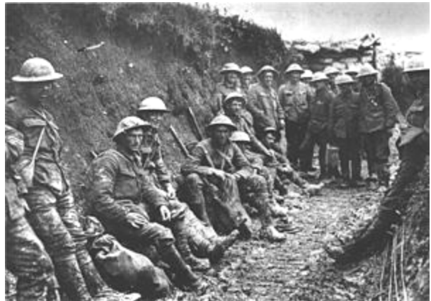
Royal Irish Rifles during Battle of the Somme

382586 Ftr. 267. Brigade. Royal Garrison Artillery